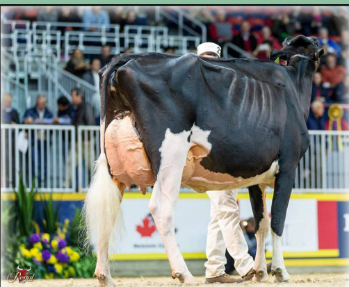
Co-Vale Dempsy Dina 4270-ET (EX-91)